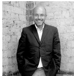
Wayne Hemingway Design Partner, HemingwayDesign