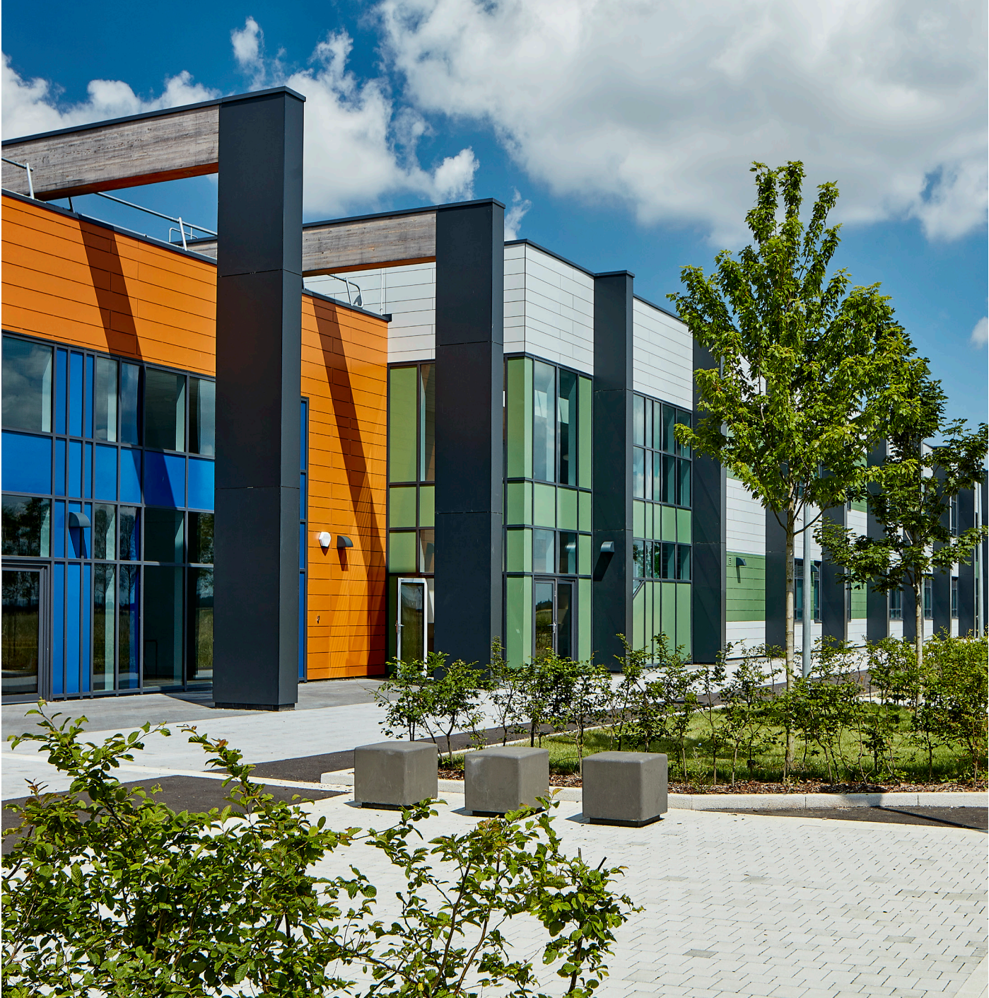
Sybil Andrews Academy , Concertus Design and Property Consultants